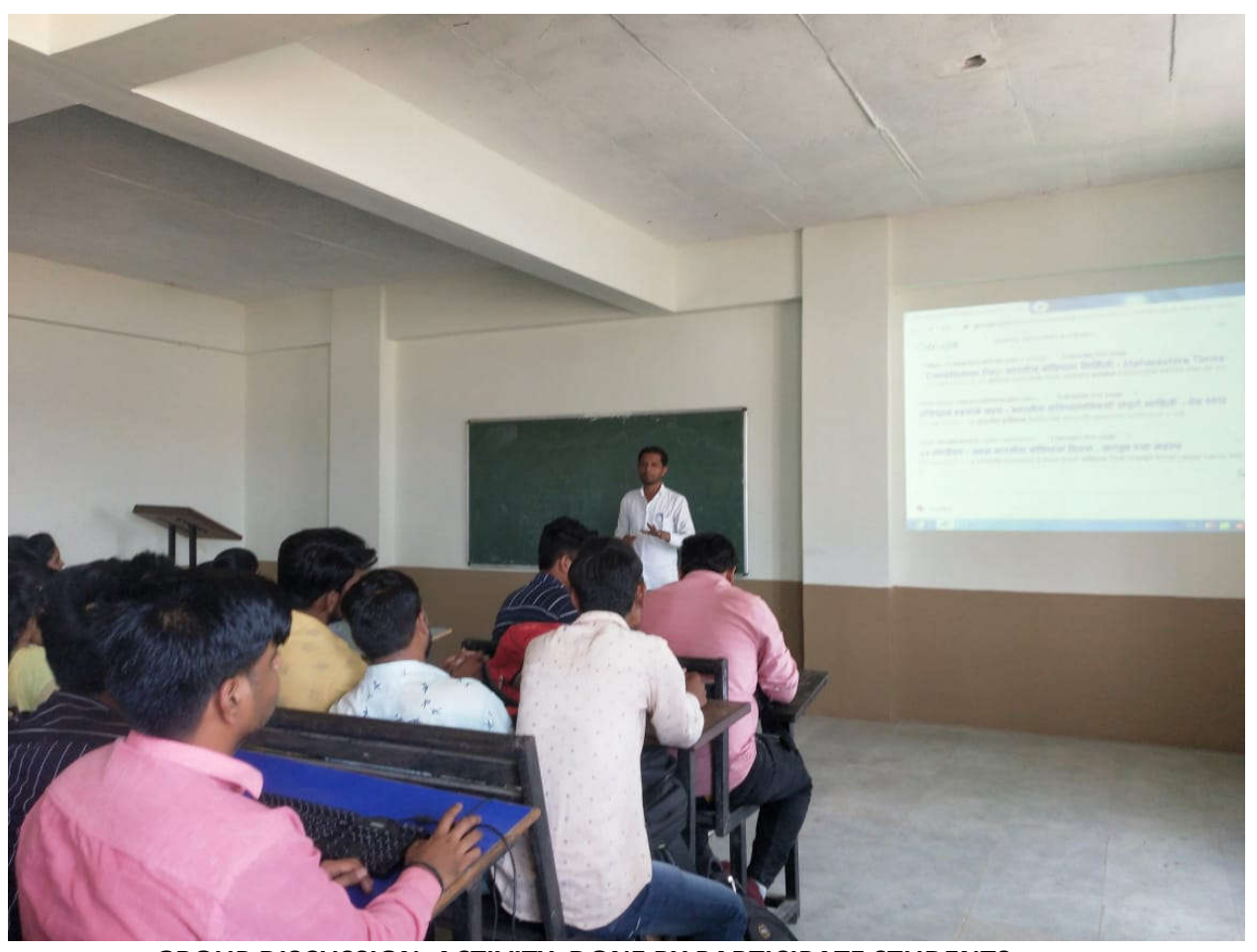
GROUP DISCUSSION ACTIVITY DONE BY PARTICIPATE STUDENTS