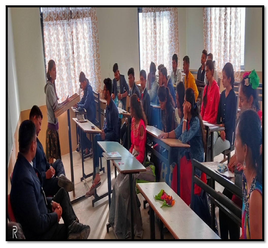
PROGRAMME CONDUCT ON MANAGERIAL SKILLS BY PROF.SALVE.M.B