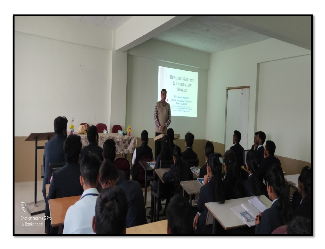
RESUME WRITING AND INTERVIEW SKILLS