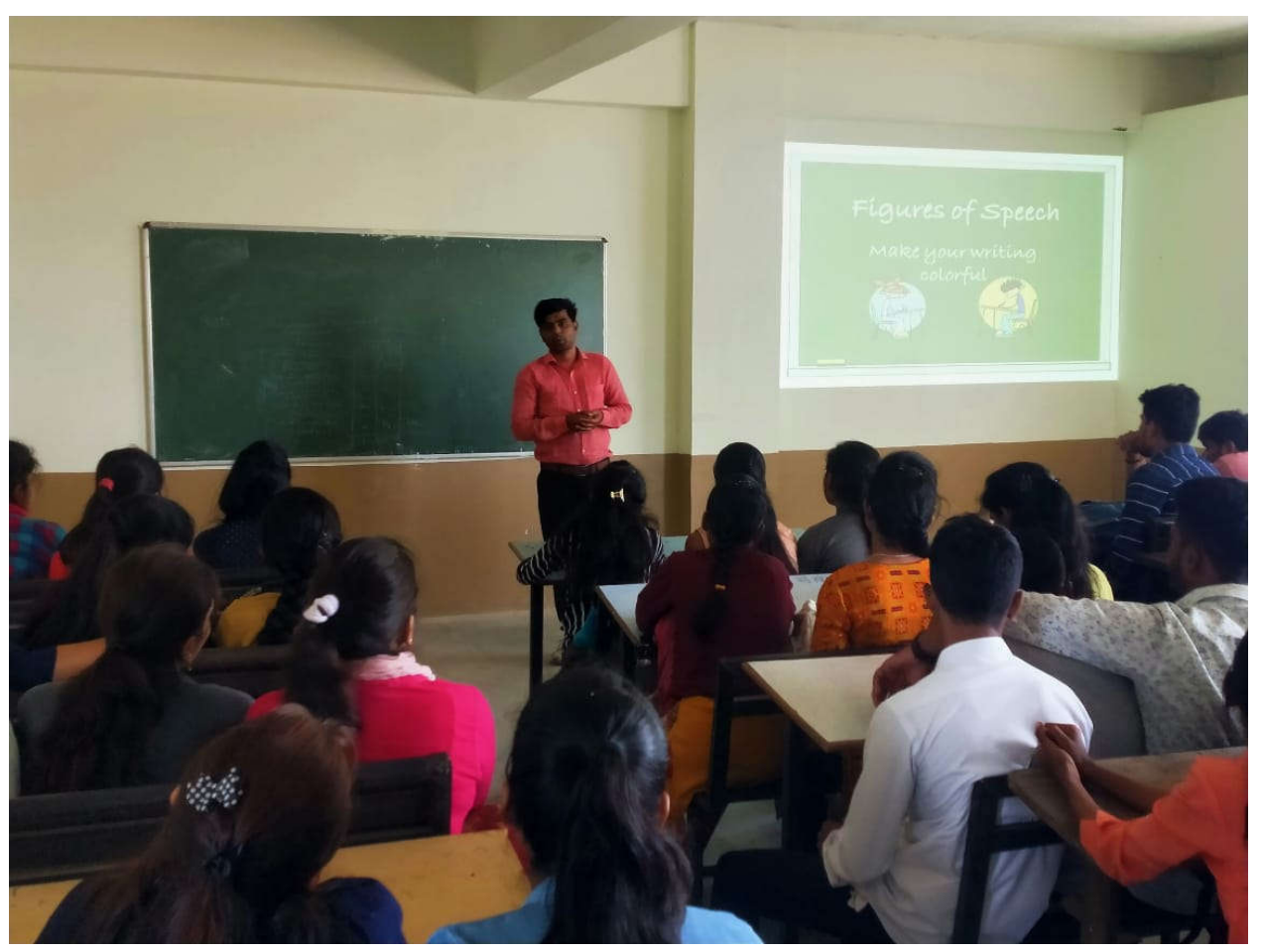
DEBATE ACTIVITY PROGRAMME DONE BY PARTICIPATE STUDENTS