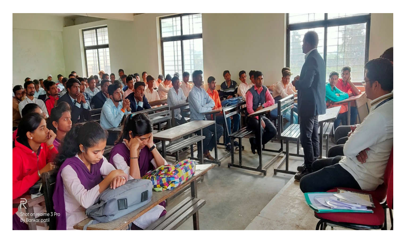
PROGRAMME CONDUCT ON PERSONALITY DEVELOPMENT