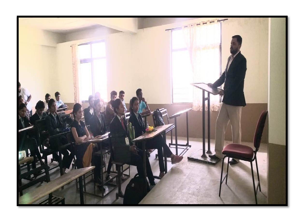
COMMUNICATION SKILLS PROGRAMME CONDUCTED BY PROF. GAIKWAD RATANPRABHA