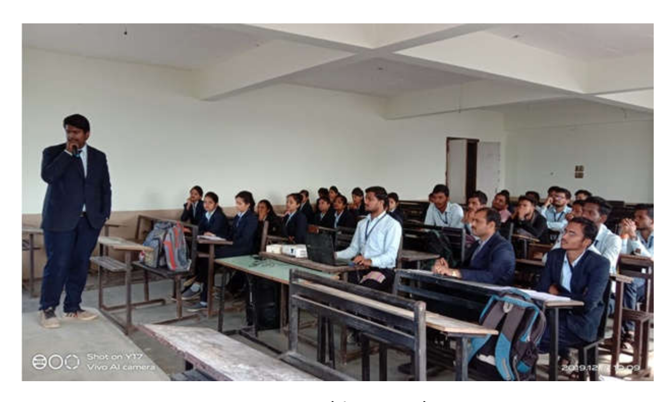
Ex-Tempore (Class Activity)