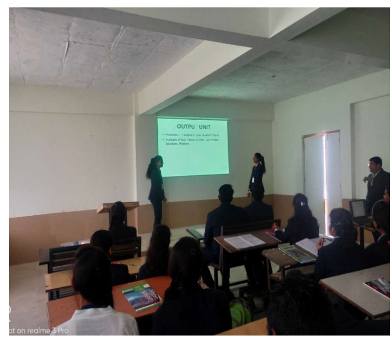
PPT Presentation Competition