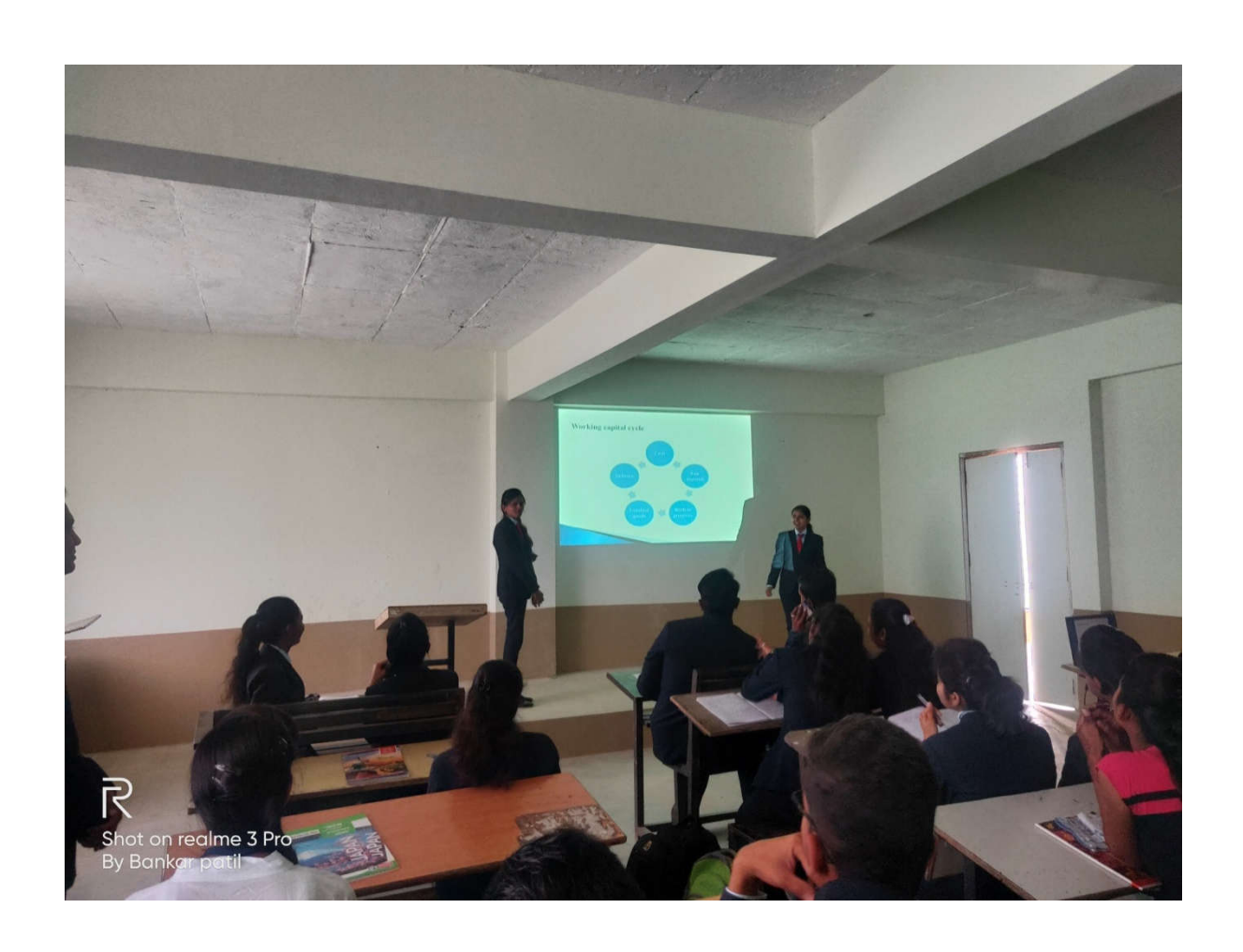
PPT Presentation (Class Activity)