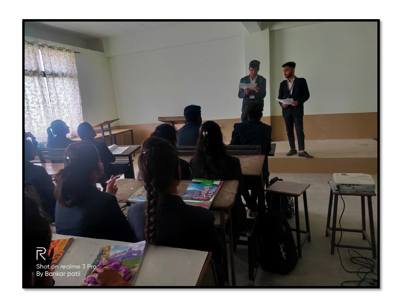
COMMUNICATION SKILLS PROGRAMME CONDUCTED BY STUDENTS