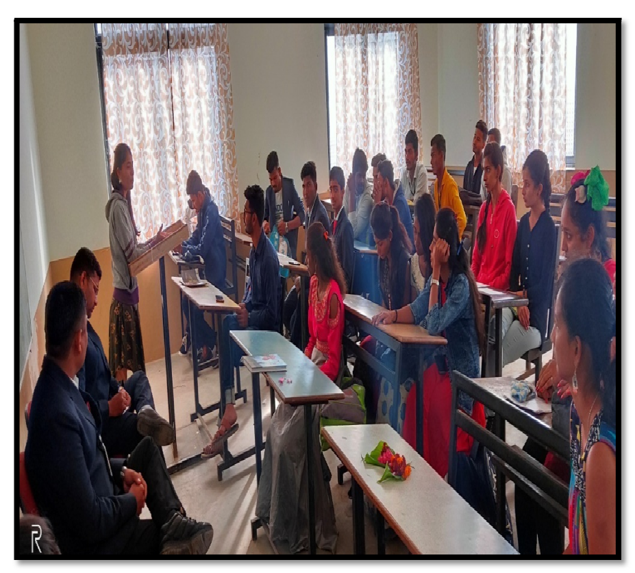
PROGRAMME CONDUCT ON MANAGERIAL SKILLS