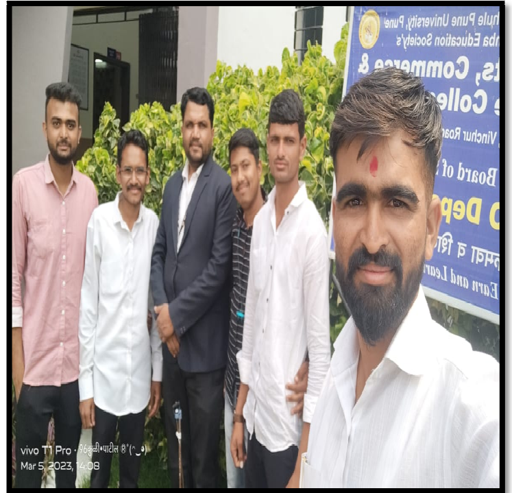
Alumni Meet Programme Conducted by IQAC BBA Department