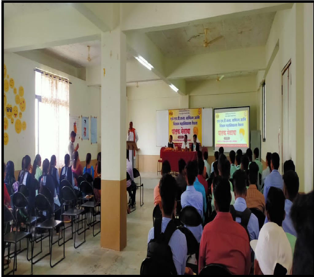
Guest Lecture conducted on Parents Meet by Nivruti Maharaj